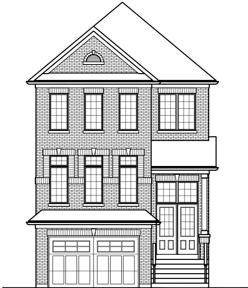
FRONT ELEVATION 'A'