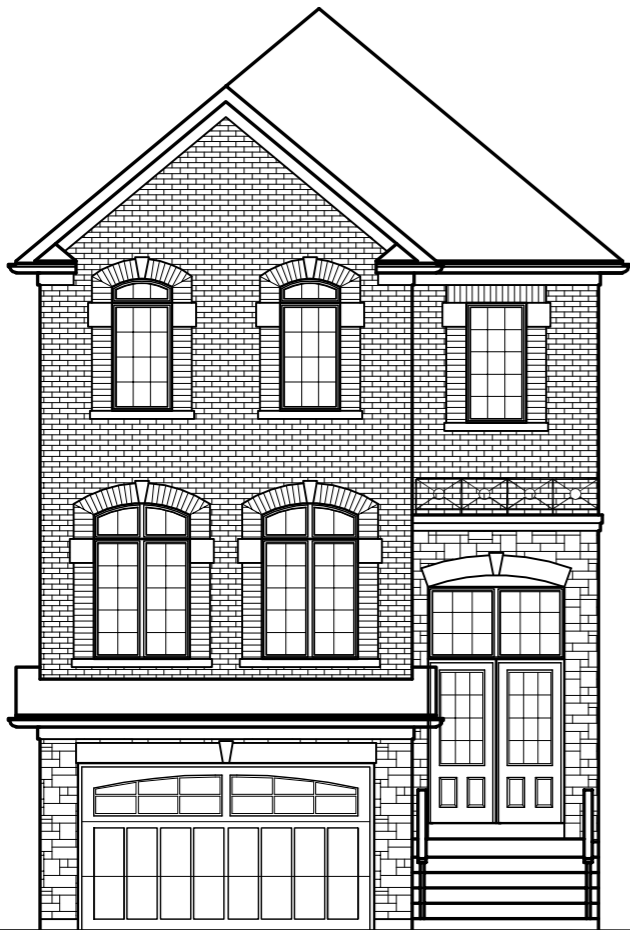
FRONT ELEVATION 'B'